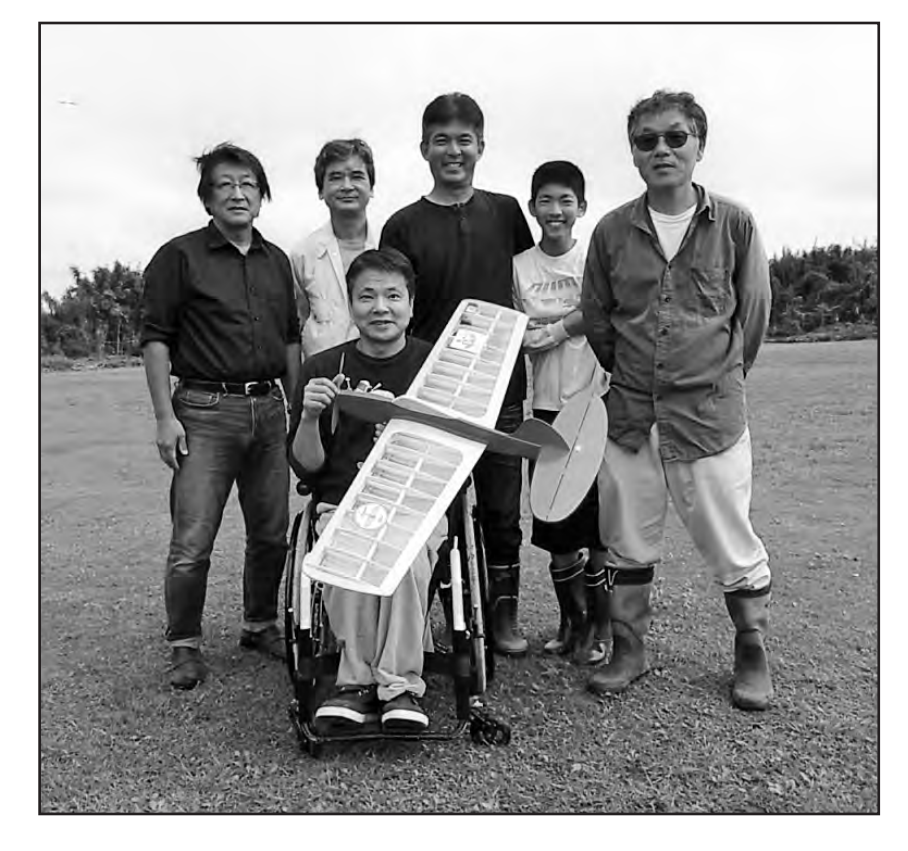
The goal for 2014 was set at 2500 flights. Once again control line modelers from around the World turned out to participate in the Annual Worldwide Ringmaster Fly-A-Thon! New countries represented for 2014 were Germany, Argentina and Slovakia! That goal

The final tabulation for the 2013 Worldwide Ringmaster Fly-A-Thon went over the top with 2334 flights recorded. An eager group of Australian fliers put up 430 and vowed to do better the next year! New fliers from the Netherlands and Japan joined in the fun!