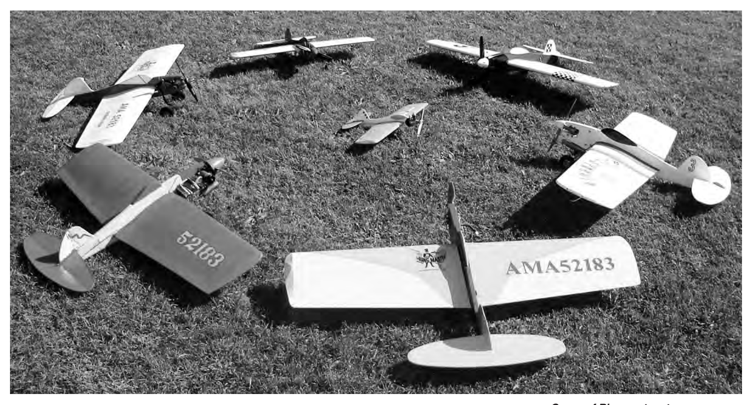
Group of Ringmasters to be flown at Hobby Hideaway, 2008.