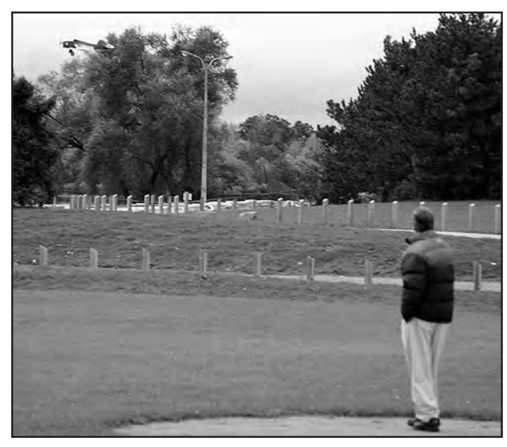
In 2011 encouraged by the increased interest in the Fly-A-Thon, we set what others considered an impossible goal of having 1500 flights for the 2011 Fly-A-Thon.

In 2011 we were joined by several additional countries including the UK and South Africa and with their help, along with an enthusiastic response from many US and Canadian modelers, we went over the 1500 flight goal by recording 1505 Ringmaster flights worldwide!!!