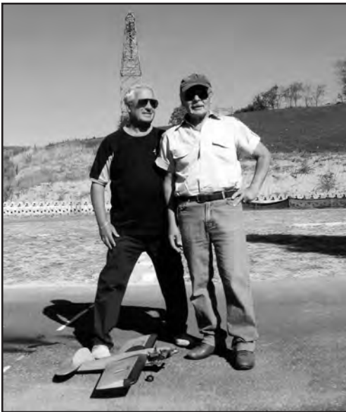
left: Italian fliers and their Ringmaster , 2010.