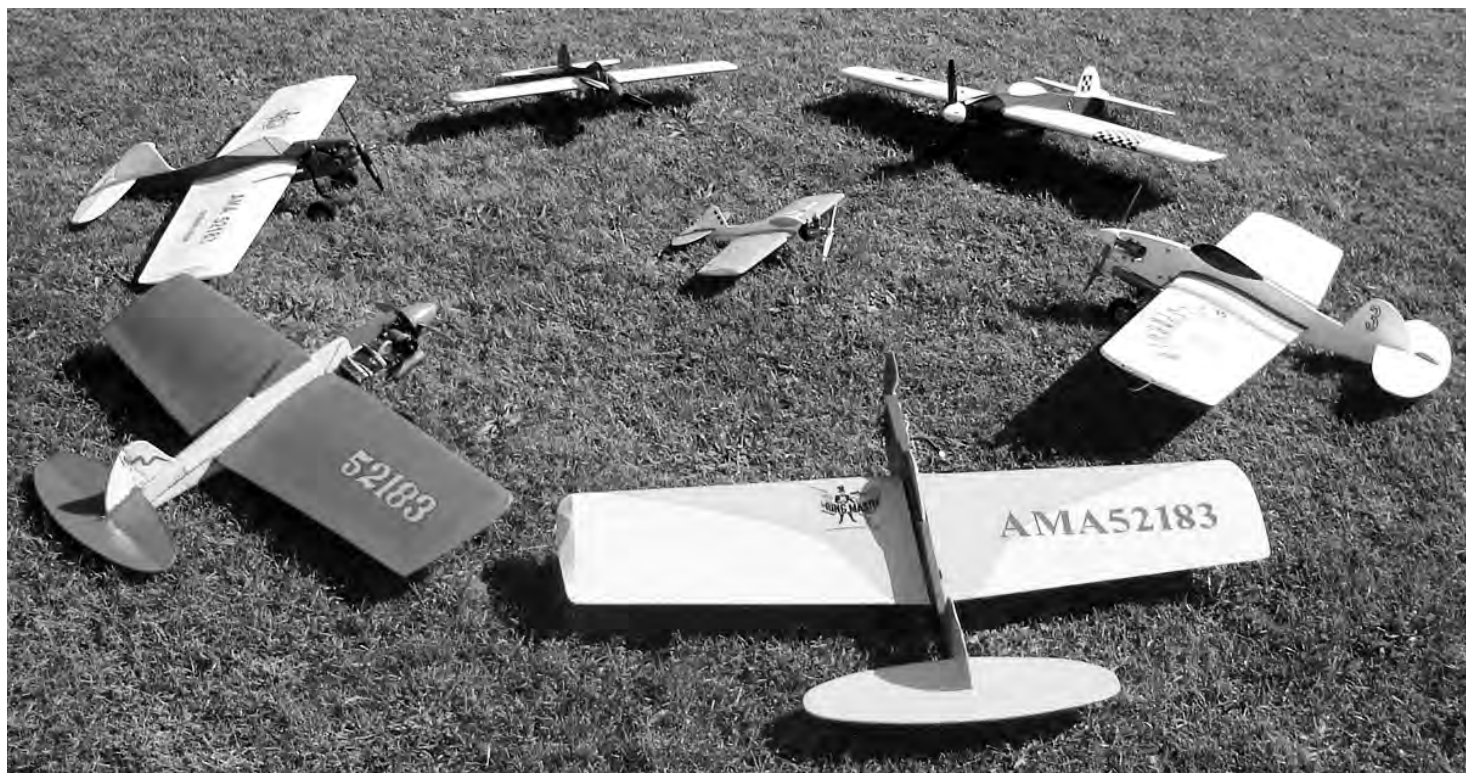
Group of Ringmasters to be flown at Hobby Hideaway, 2008.