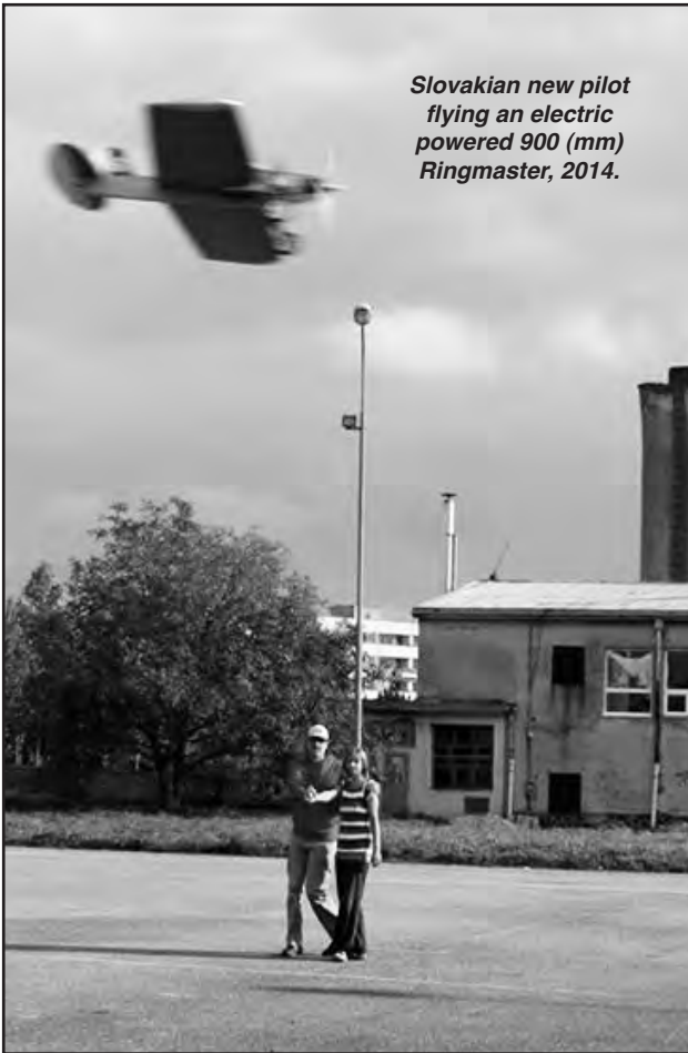
Slovakian new pilot flying an electric powered 900 (mm) Ringmaster, 2014.

of 2500 Ringmaster flights was broken with 476 pilots recording 2714 flights!!