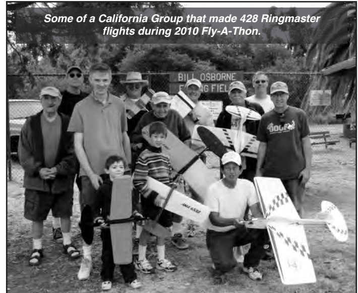
Some of a California Group that made 428 Ringmaster flights during 2010 Fly-A-Thon.